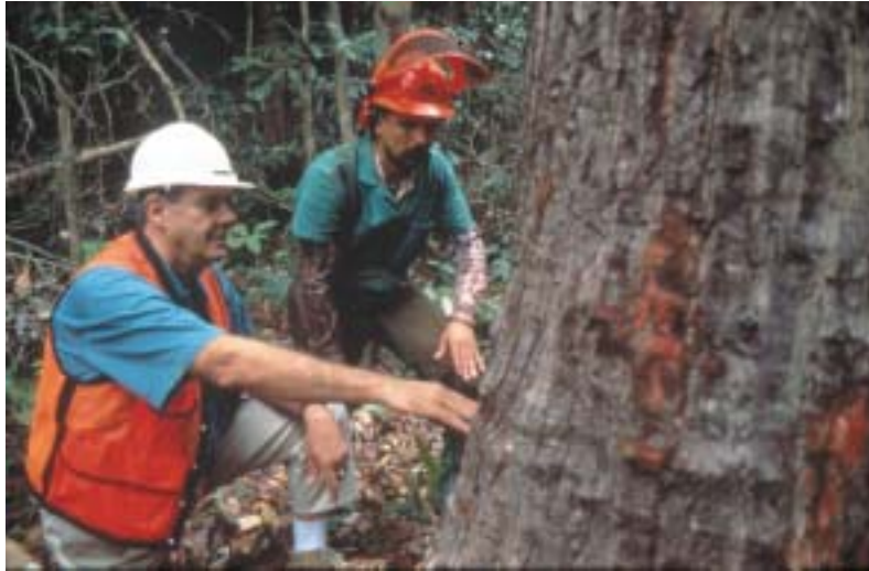
Investments in “human capital” yield payoffs in current and future harvests.