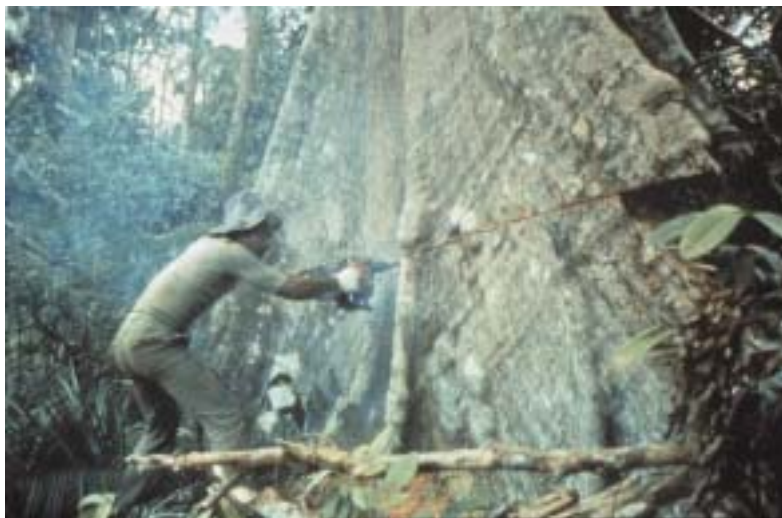
Conventional timber harvesting systems do not utilize best harvesting practices.

Rain forest logging, as conventionally practiced in the tropics, depletes timber stocks and causes severe ecological impacts on residual forests that are not accounted for in economic terms (Repetto and Gillis 1988; Johnson and Cabarle 1993). Ecological degradation of logged forests induces economic costs due to loss of ecological services such as watershed protection, carbon sequestration, harvest of non-timber forest products and conservation of biological diversity (Dixon and Sherman 1990; Chomitz and Kumari 1998). Although the economic benefits of protecting and conserving tropical forests are probably large, quantification of these benefits is rarely undertaken (Albers, Fisher and Hanemann 1996; Kramer and Mercer 1997). Economic cost-benefit analysis may ultimately justify the institution of financial incentives or imposing regulations on the forest products industry to adopt sustainable management practices. However, funding mechanisms for financial incentive programs are uncertain and existing forestry regulations are often not fully enforced. Consequently, an alternative strategy to promoting good forestry practices in the tropics is to evaluate under what conditions the financial profitability of firms can be increased by adopting best forestry practices (Putz, Dykstra and Heinrich 1999). That is, can economic self interest help mitigate the loss of ecological services in tropical forests subject to logging?