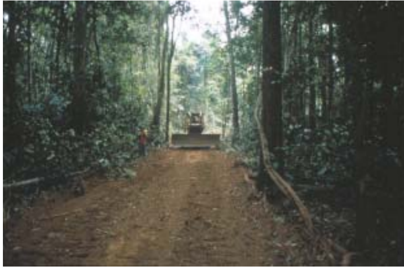
Minimizing the width of forest roads reduces costs and decreases ecological damage.

Fixed cost per cubic meter ( f ) associated with pre-harvest, harvest planning and infrastructure stages were computed for each activity using the formula: