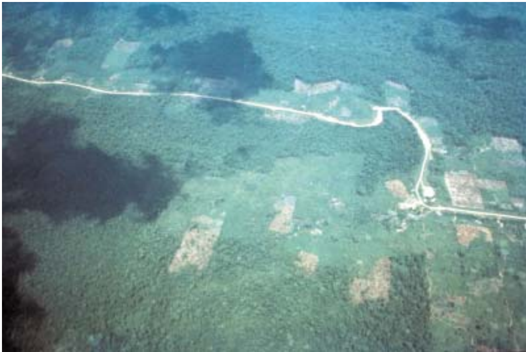
Roads cause land use changes by providing market access for agricultural and forestry products.

FFT established Block 1 as a conventional logging block, Blocks 2, 3, 4 and 6 as RIL blocks, and Block 5 as an unharvested control (see Cauaxi Block Layout at end of report). FFT conducted 100% pre-harvest inventories of commercial and potentially commercial trees on all blocks and established permanent plots representing 1% of the area in each of the blocks. 2 Pre-harvest inventories included all commercial and potentially commercial trees greater than or equal to 35 cm d.b.h. on blocks 1 (CL) and 3 (RIL). Post-harvest inventories were also conducted on blocks 1 and 3 to allow computation of waste and damage.