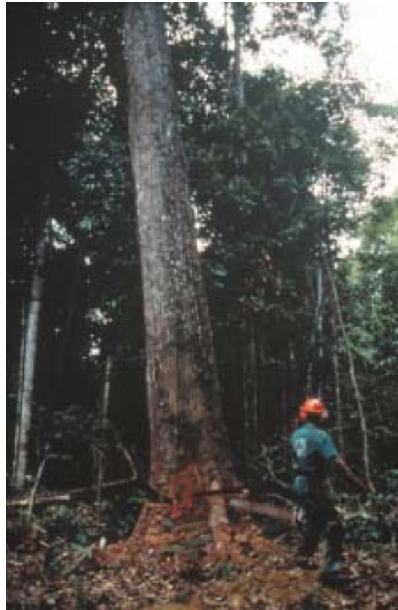
Directional felling is a key step in reducing damage to the residual stand and increasing logger safety.

Timber harvesting on RIL blocks at Cauaxi were designed to be efficient, but not necessarily least-cost. Harvesting activities were planned up to 8 months in advance and crews were trained in RIL methods. A full inventory of commercial and potentially commercial trees greater than 35cm dbh occurred 7 months in advance of harvest and vines were cut at that time. A crawler tractor (Caterpillar D6 SR) was used for construction of roads and log decks and a rubber tire skidder (Caterpillar 525) with winch and grapple was used for skidding operations. Skid trails were laid out, but not constructed, in advance. Trees were directionally felled and sawyers used a Stihl AV 51 chainsaw for felling and bucking operations. Logs were sorted and loaded on the log deck with a Caterpillar 938F Loader. Roads, log decks and principal skid trails were constructed to be part of the permanent infrastructure to be available for the next harvest.