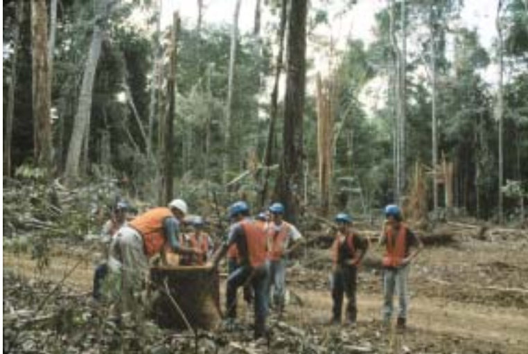
Conventional logging creates large gaps in the forest canopy, severely damages residual trees and has negative impacts on forest soils.

while two technicians assessed and recorded damage. Severity of damage to bole and crown, cause of damage, and health status of each tree in the census were assessed using a modification of the method reported by Johns et al. (1996), and is shown in Table 1.